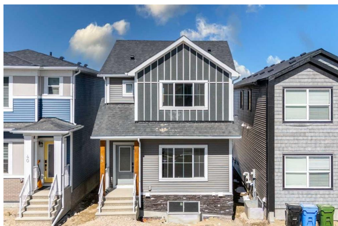
44 Lewiston Dr NE, Calgary, AB

Welcome to Your Dream Home- Presenting an exceptional opportunity to own a brand new, two-story home in the sought-after community of Lewisburg. Designed for modern living, this stunning residence seamlessly blends elegance, functionality, and comfort. Upon entering, you'll be greeted by an abundance of natural light and an open-concept layout that effortlessly connects the inviting family room, illuminated living room, and stylish kitchen. Luxury vinyl plank flooring flows throughout the main level, offering both durability and timeless appeal. This home surpasses standard builder specifications with premium upgrades, including sleek cabinetry, elegant interior doors, designer light fixtures, and sophisticated quartz countertops in the kitchen and bathrooms. Every detail has been carefully curated for refined living. Upstairs, discover three generously sized bedrooms, each offering comfort and charm. The primary suite is a true retreat, featuring a spacious layout, a double vanity, and a separate shower. The unfinished basement presents a versatile space with a separate exterior entrance and a bathroom rough-in- ideal for future development as a legal suite. Your vision can easily come to life. Step outside to the backyard with a large deck, perfect for entertaining or relaxing. Located near the parks, pathways, and recreational facilities, with access to schools, child care, and future educational developments. Schedule Your